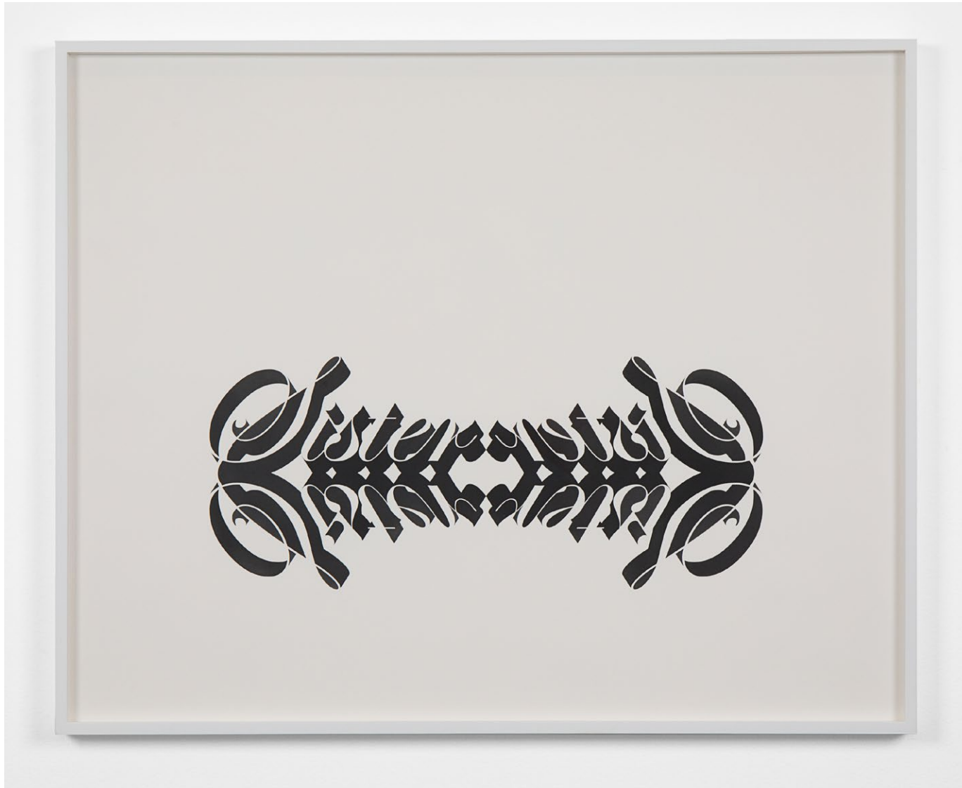
Sisters Powdered graphite on paper Sheet: 36 x 45 inches 2020 Framed*

*Premium hard maple frame finished with flat white lacquer. Photo mounted on Sintra. Glazed with Optium museum conservation plexiglass with 99% UV rating. Spaced with acid free spacers