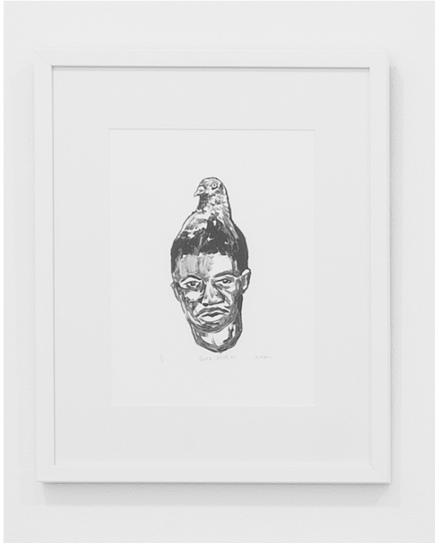
Black Dove #1 Monotype Print 20 x 16 inches 2022 Framed