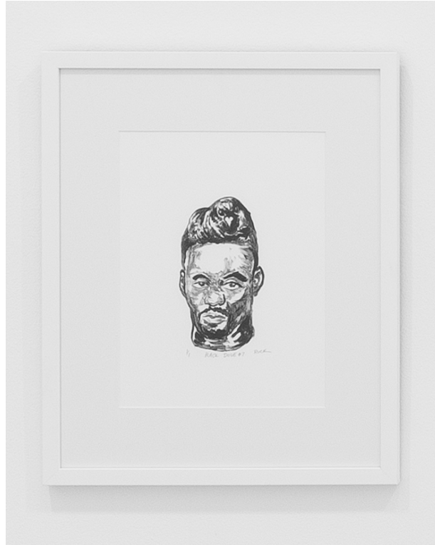
Black Dove #7 Monotype Print 20 x 16 inches 2022 Framed