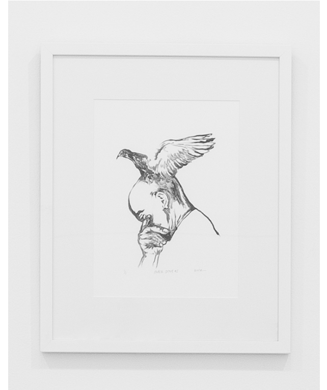
Black Dove #2 Monotype Print 20 x 16 inches 2022 Framed