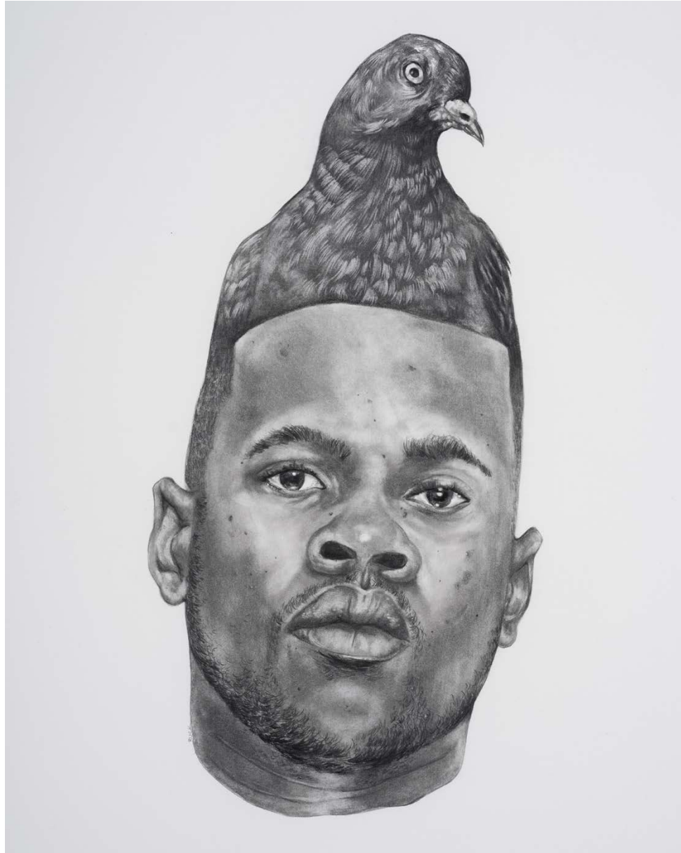
A Little Birdie Told Me Graphite on Stonehenge 250gsm paper 52 x 42 inches 2022 Framed