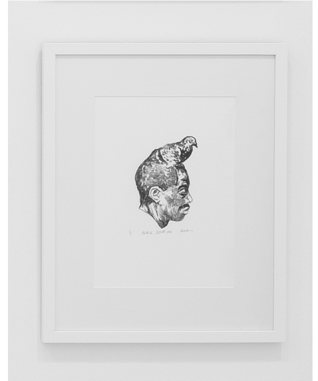
Black Dove #6 Monotype Print 20 x 16 inches 2022 Framed