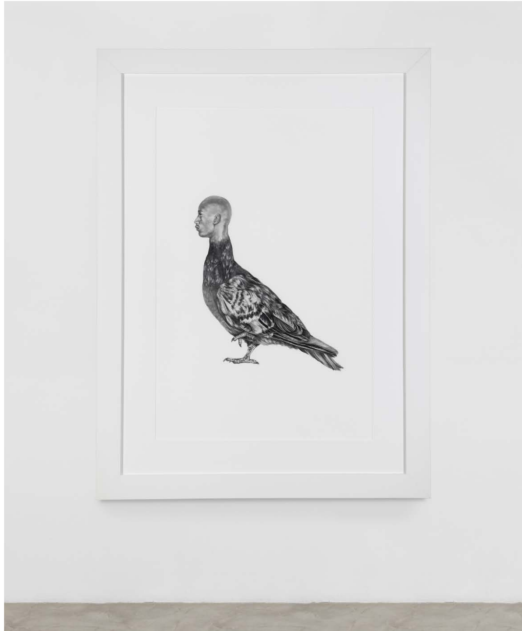
A Preferred Strut Graphite on Stonehenge 250gsm paper 52 x 42 inches 2021 Framed