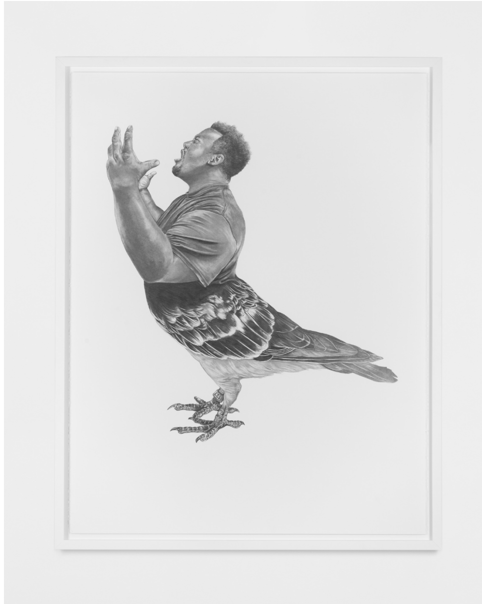
The Stretching Graphite on Stonehenge 250gsm paper 52 x 42 inches 2022 Framed

This drawing symbolizes the act of stretching and releasing tension in preparation of flight. When we stretch as humans it is about flexibility, range of motion, maintaining muscle strength and maybe most importantly to reduce the risk of injury. Stretching in many ways is an act of self care which helps us operate in fullness.