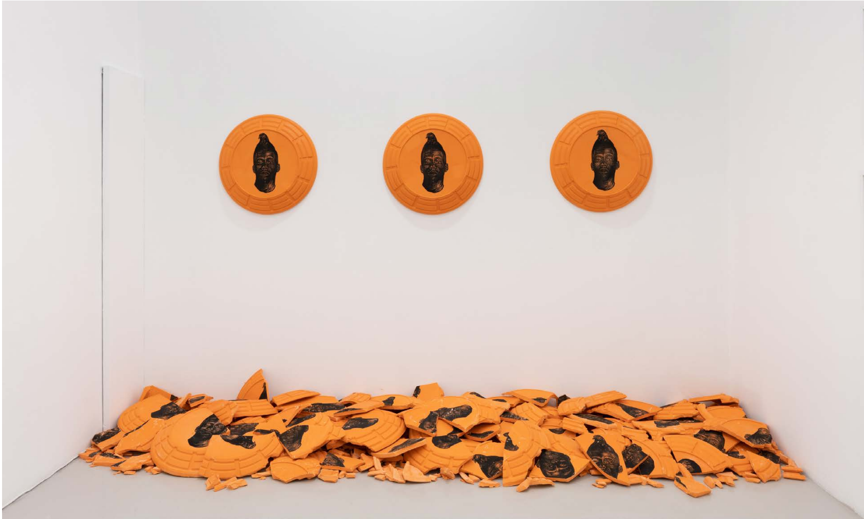
I Hit More Than I Missed Installation Cast plaster 23 x 21.5 inches/each Edition 1 of 2 2021