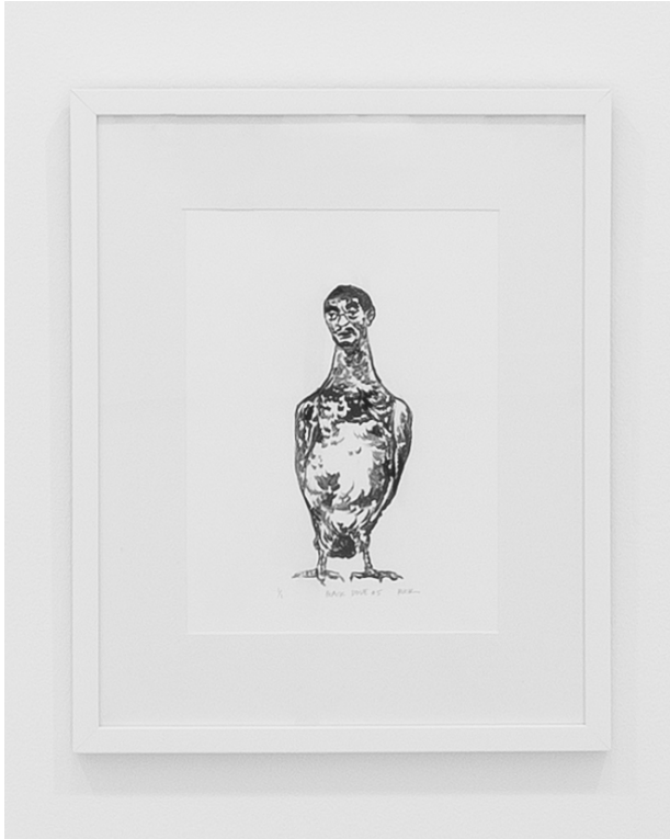
Black Dove #5 Monotype Print 20 x 16 inches 2022 Framed