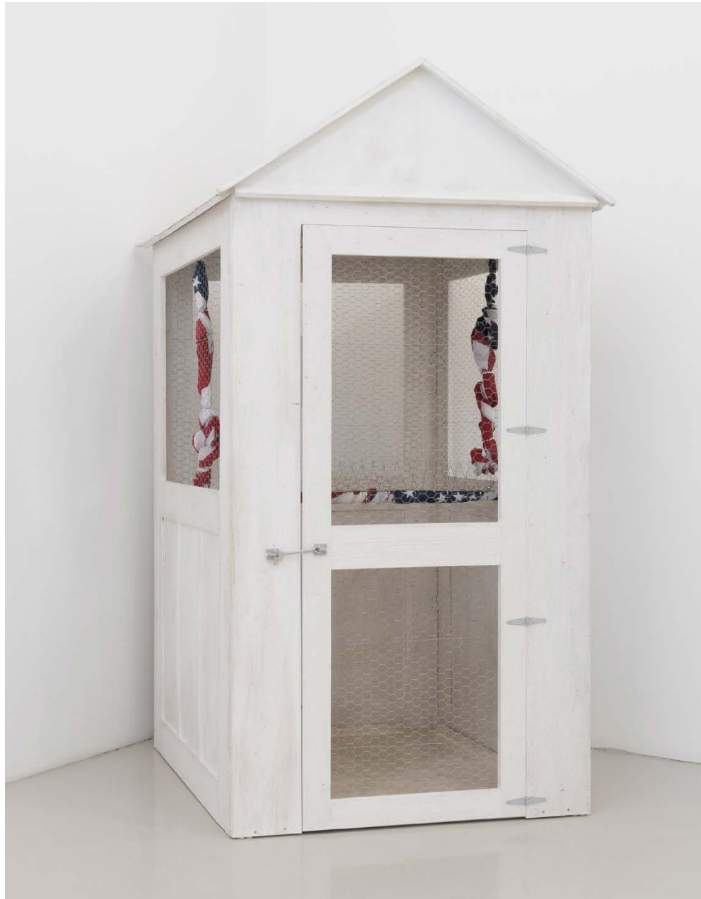
A Perilous Perch Wood, chicken wire, American flags, pigeon spikes 97 x 52 x 53 inches 2021