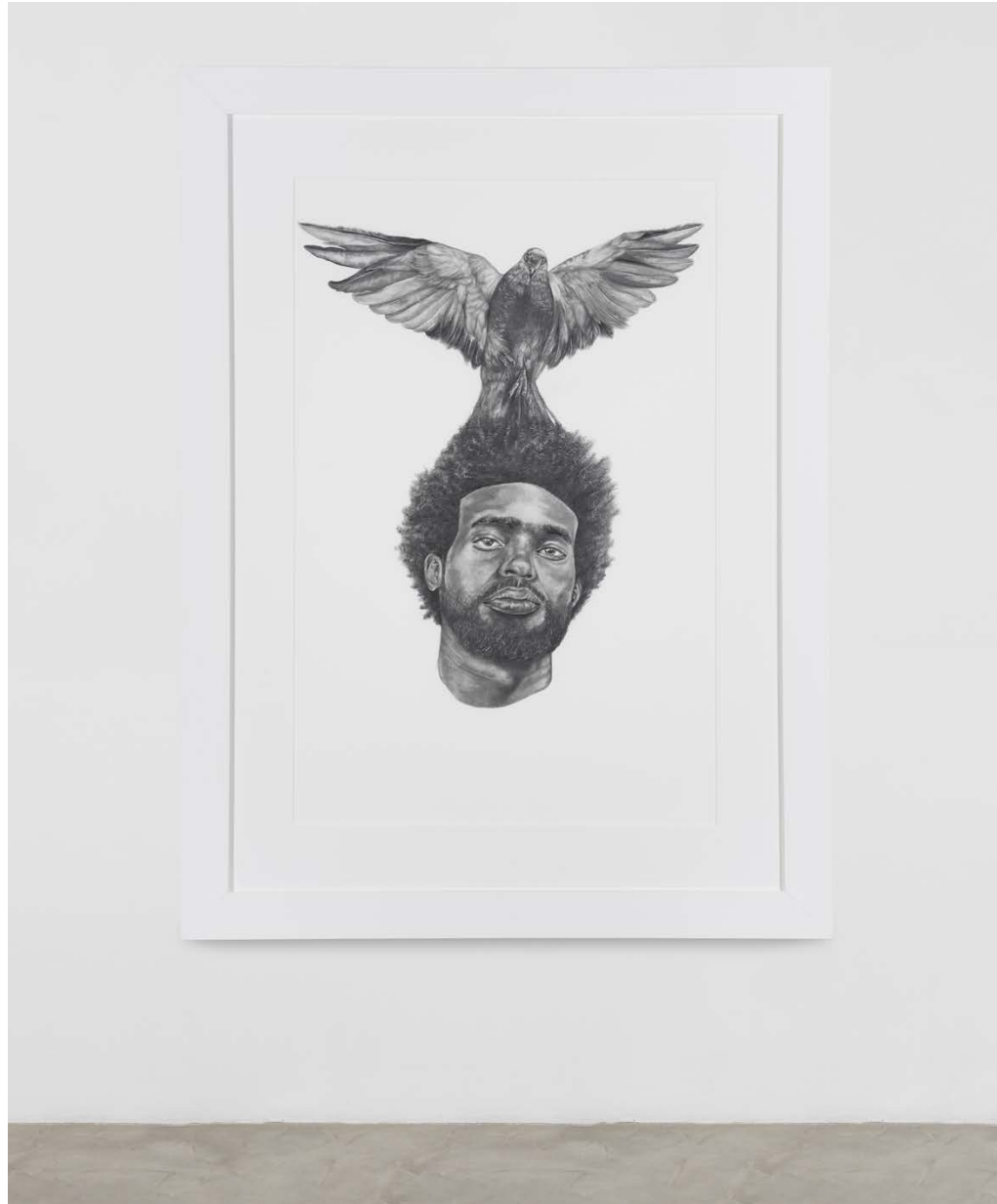
I Left At First Light Graphite on Stonehenge 250gsm paper 52 x 42 inches 2021 Framed