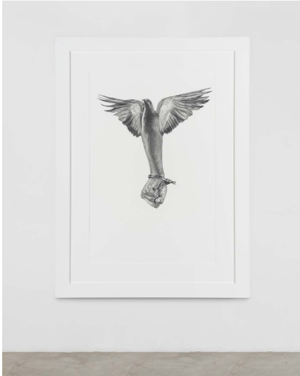
The Ascent Graphite on Stonehenge 250gsm paper 52 x 42 inches 2021 Framed