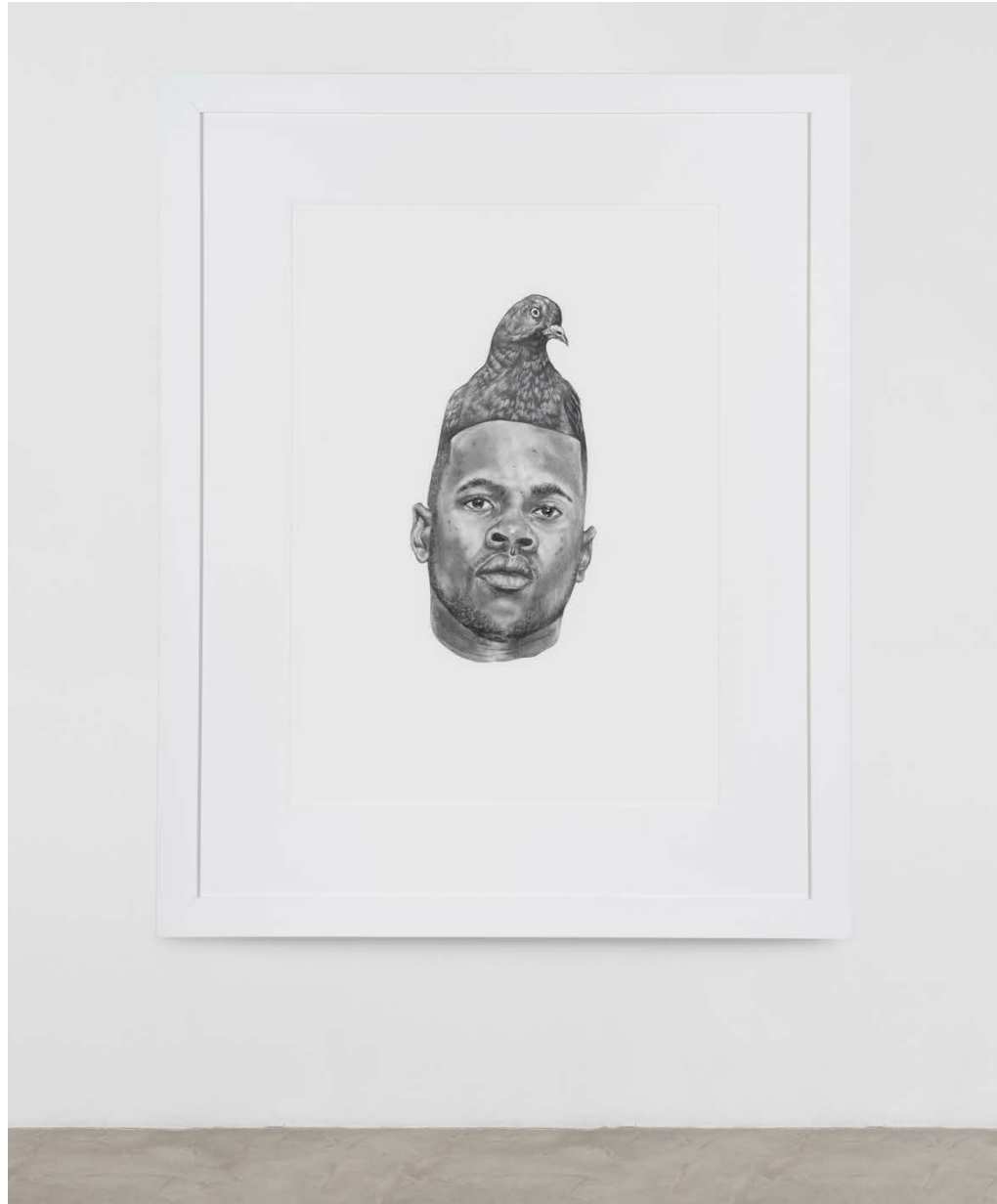
A Little Birdie Told Me Graphite on Stonehenge 250gsm paper 52 x 42 inches 2022 Framed