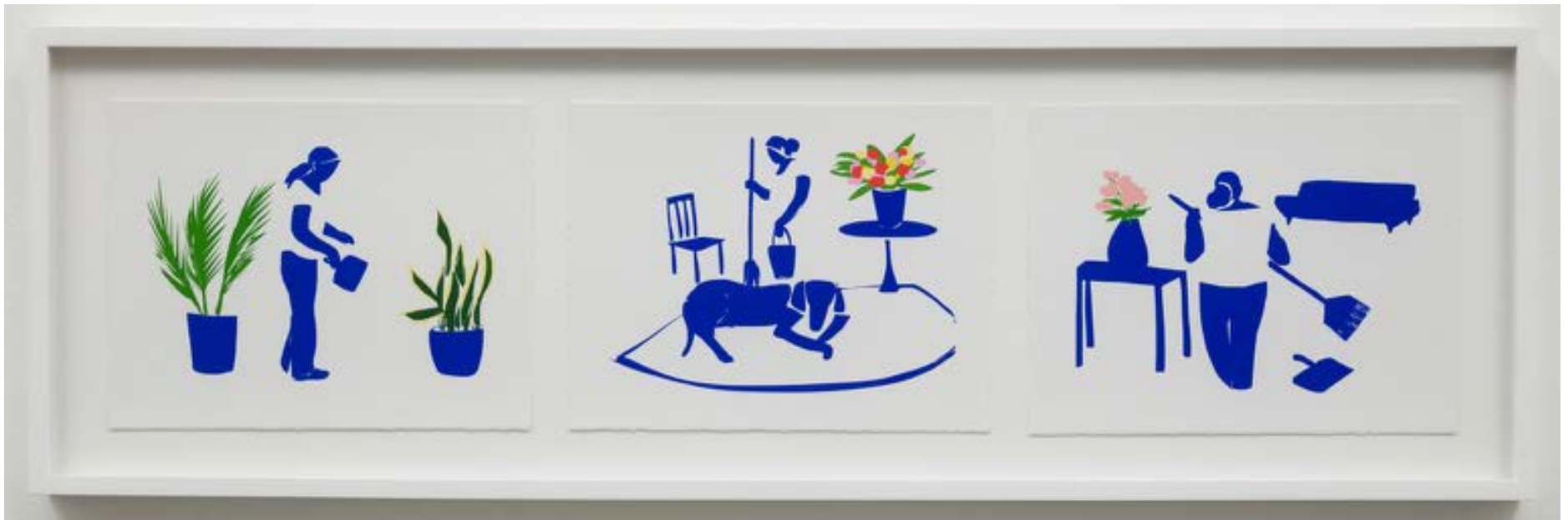
Azul - Three Scenes Three archival pigment prints on paper Edition of 20 w 5 APs Framed: 15 x 30 inches 2019