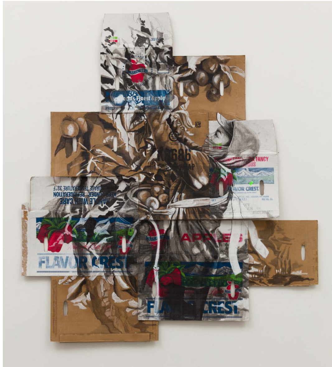
Ruby Flavored Ink, Gouache, and Charcoal on Recycled Produce Cardboard Box 59 x 53 Inches 2019