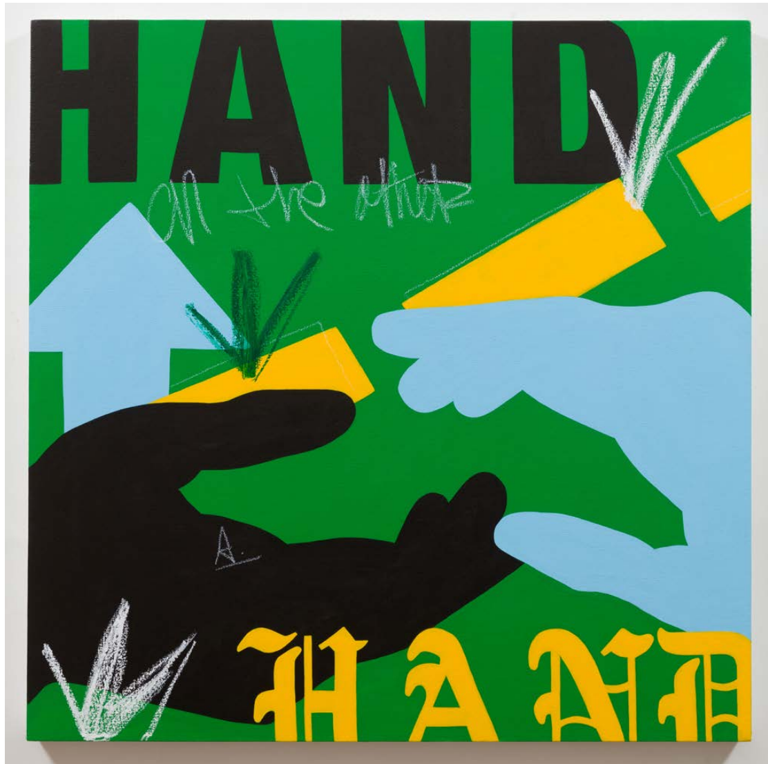
On the other hand Acrylic and oil stick on canvas 36 x 36 inches 2018