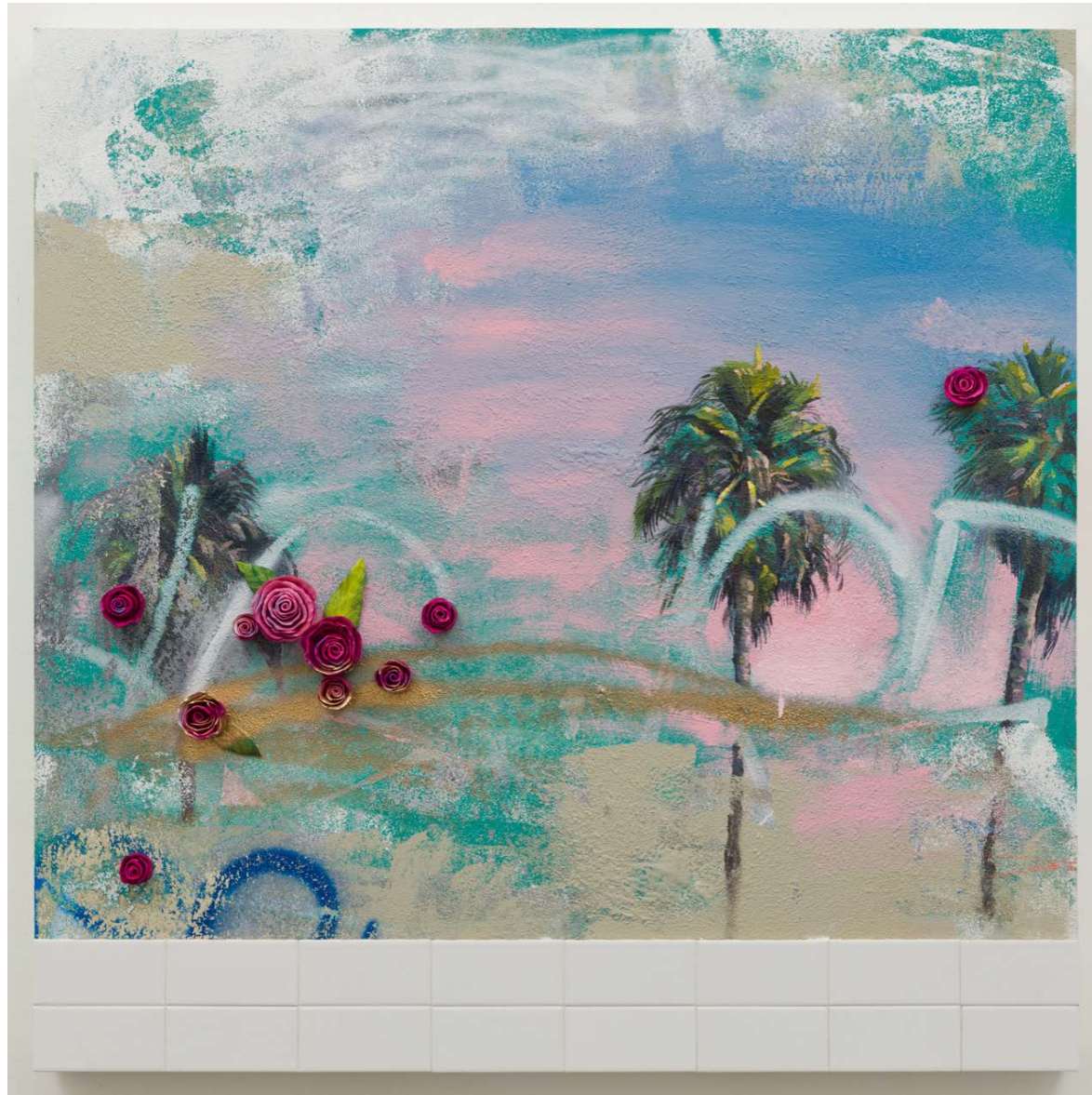
The Land of Milk and Honey 2 Stucco, ceramic, ceramic tile, acrylic paint, mean streak, spray paint and latex house paint on panel 48 x 48 inches 2019