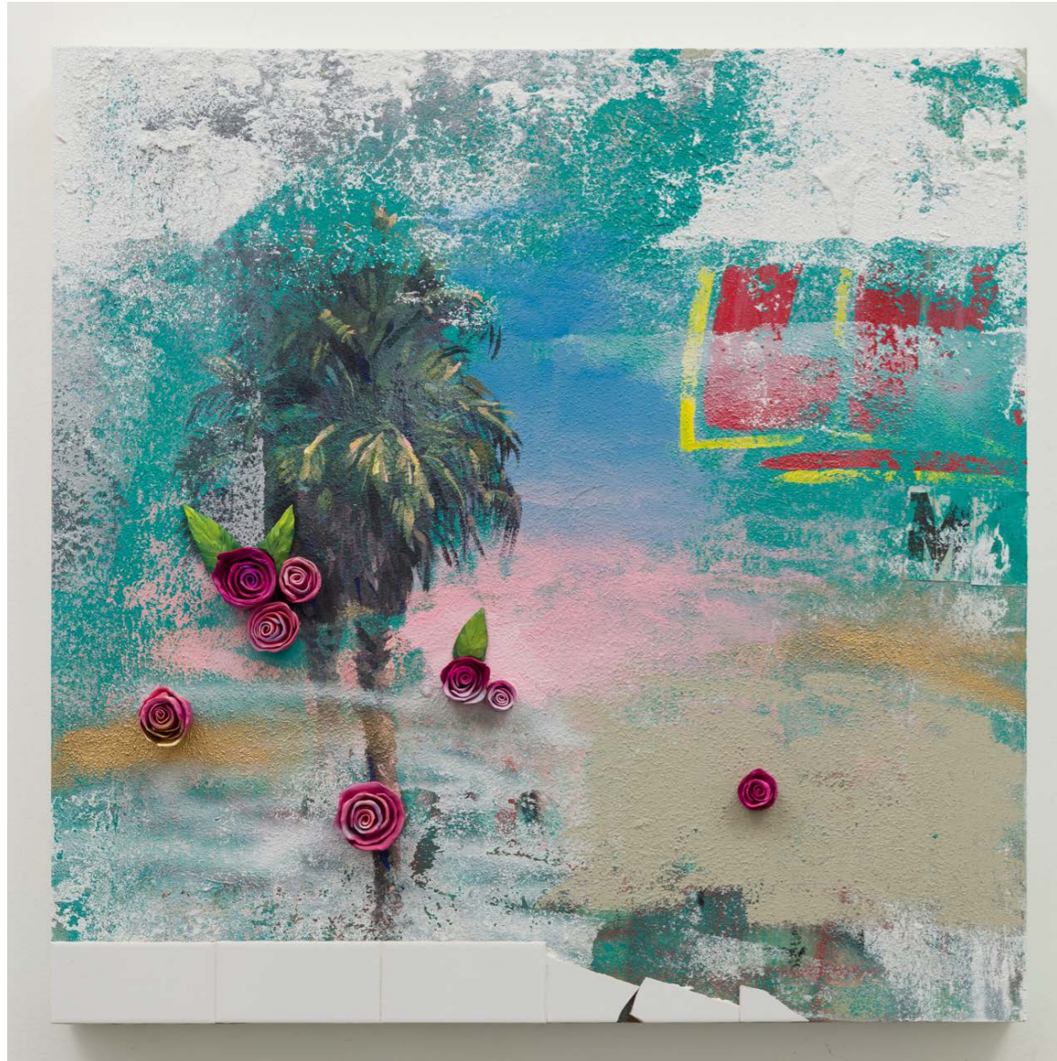
The Land of Milk and Honey 4 Stucco, ceramic, ceramic tile, acrylic paint, mean streak, spray paint and latex house paint on panel 36 x 36 inches 2019