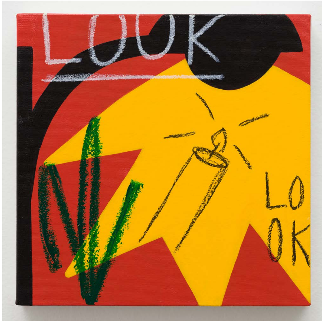
Double Vision Acrylic and oil pastel on canvas 12 x 12 inches 2019