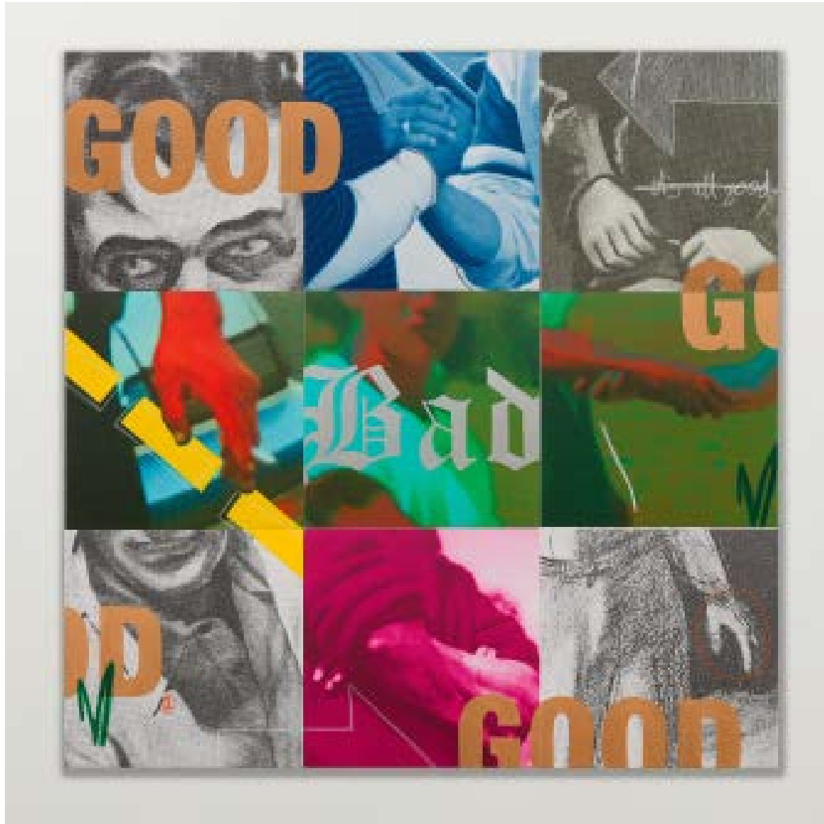
It's All Good Acrylic, oil stick, oil pastel and archival pigment prints on canvas 72 x 72 inches (overall) 24 x 24 inches (each panel) 2019