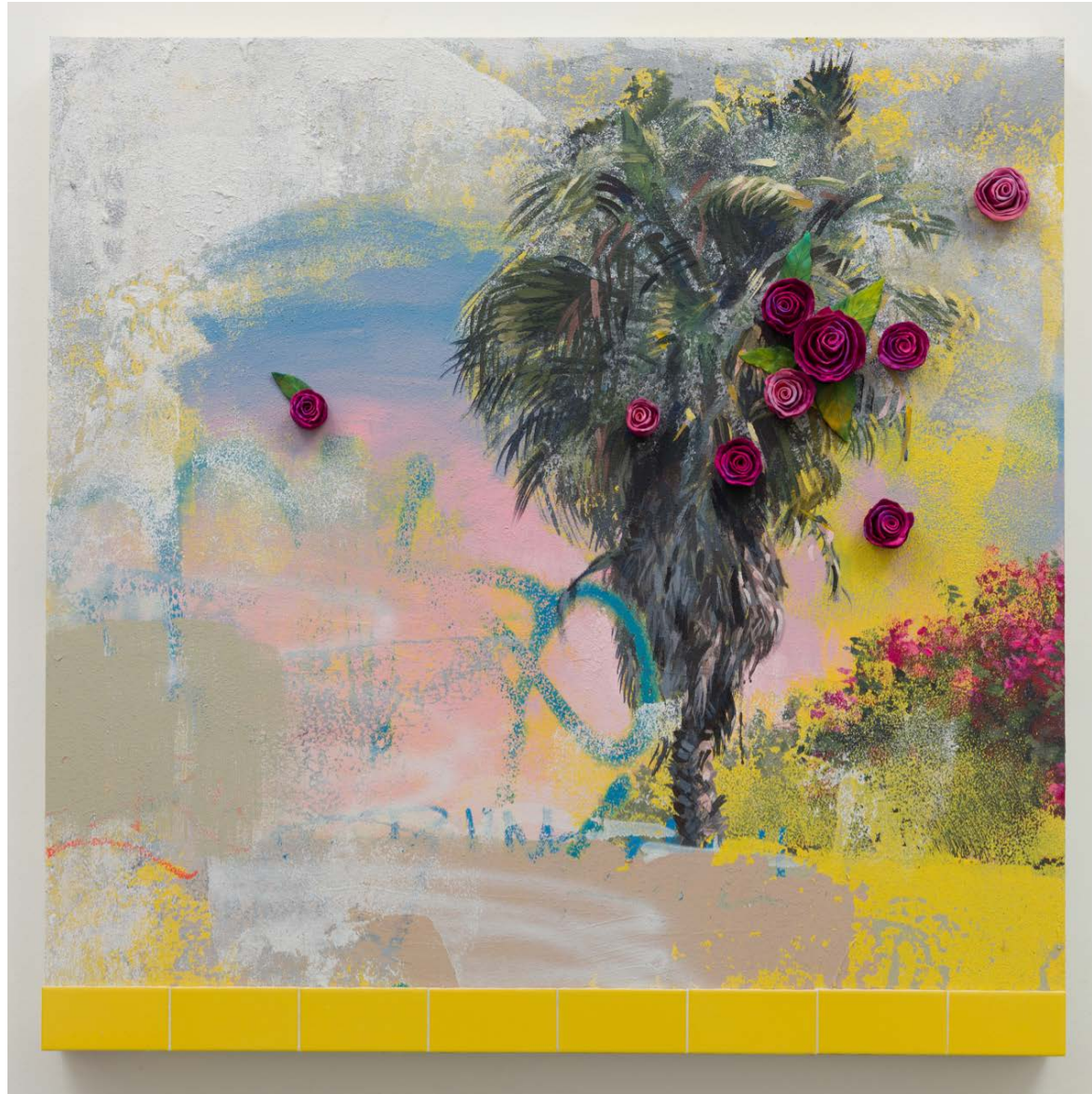
The Land of Milk and Honey 1 Stucco, ceramic, ceramic tile, acrylic paint, mean streak, spray paint and latex house paint on panel 48 x 48 inches 2019