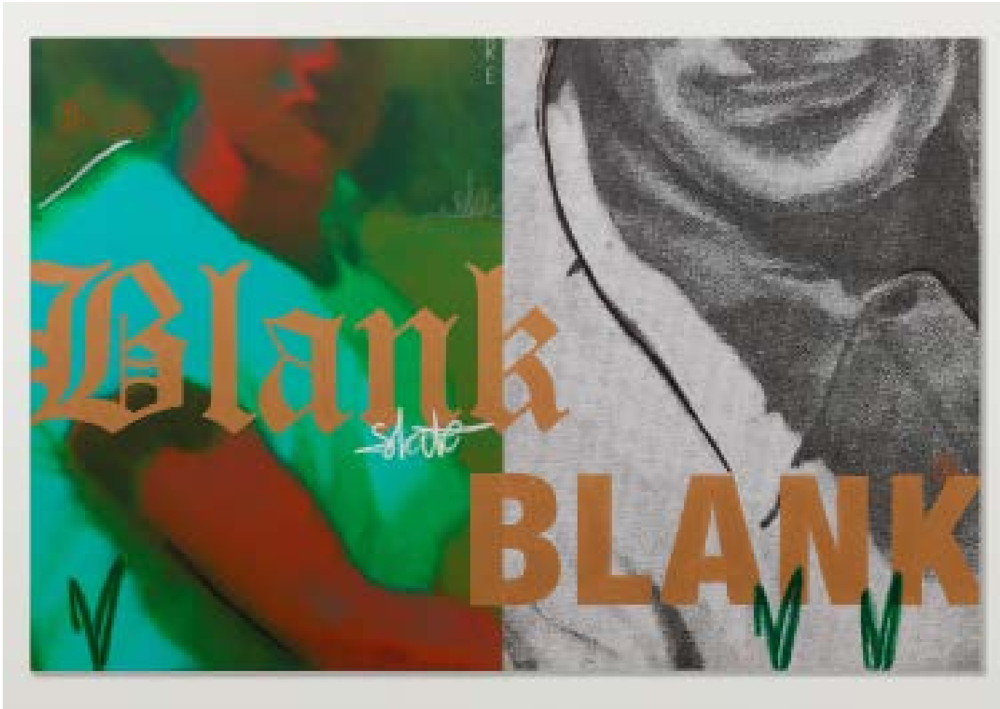
Blank Slate Acrylic, oil stick, oil pastel and archival pigment prints on canvas 48 x 72 inches (overall) 48 x 36 inches (each panel) 2019