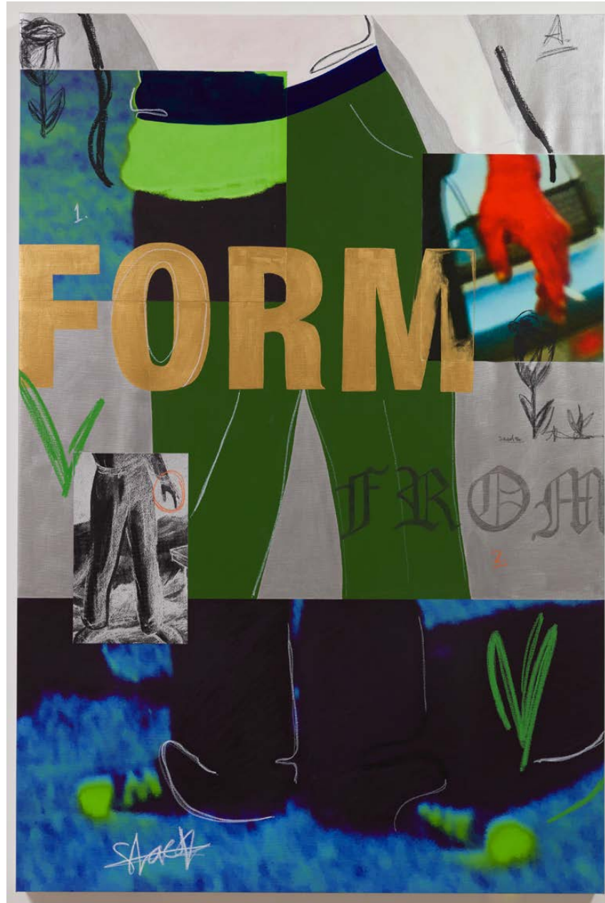
Form / From Acrylic, oil stick, graphite, oil pastel, archival pigment prints on canvas 72 x 48 inches 2019