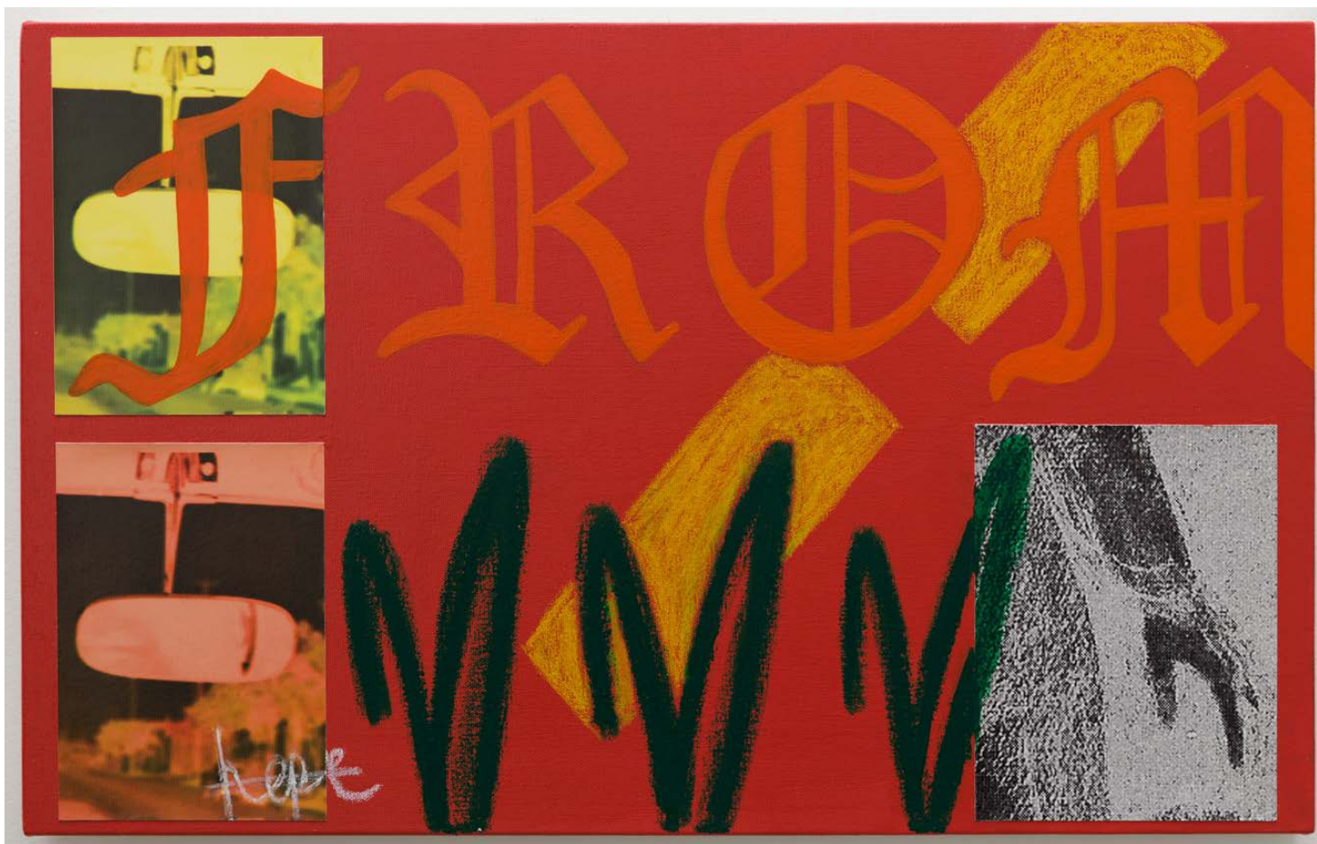
From/Here Acrylic, oil stick, graphite, oil pastel, archival pigment prints on canvas 15 x 24 inches 2019