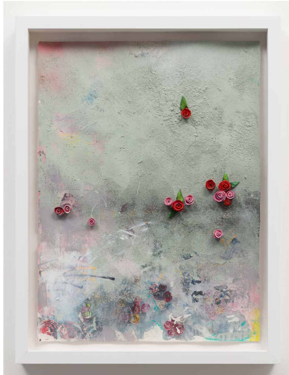
Cypress Park Stucco, paper clay, collage, print transfers, acrylic paint, mean streak, spray paint and latex house paint on archival paper Sheet: 30 x 22 inches 2019